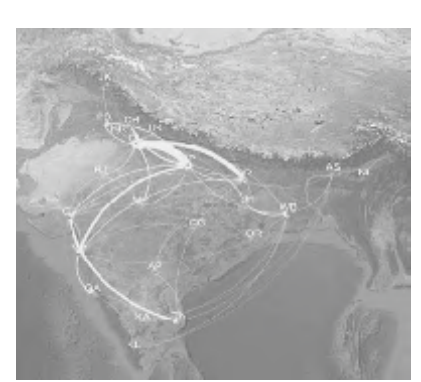
Figure 1. Top Inter-State Migration Routes

outflow-inflow states routes are Uttar Pradesh to Delhi, Bihar to Delhi, and Uttar Pradesh to Maharashtra. Figure 1 maps the largest inter-state migration route using Ministry of Railways' data on unreserved passenger traffic for the years 2011-16.